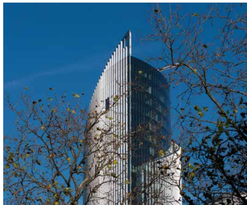
Floor plan, section and all photographs by Pierre ACCARAIN - Marc BOUILLOT Architectes Associées S.A.